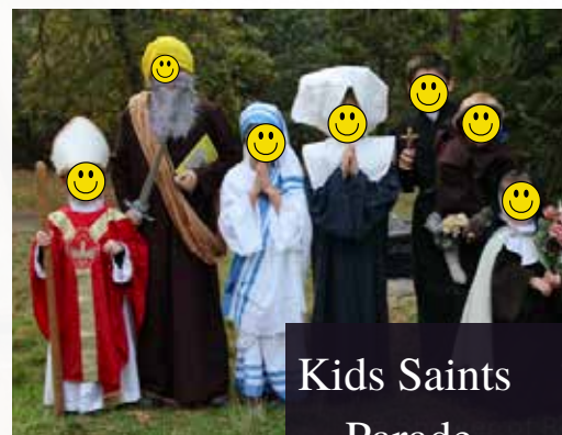
Kids Saints Parade