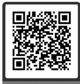
Donate - St Ann's