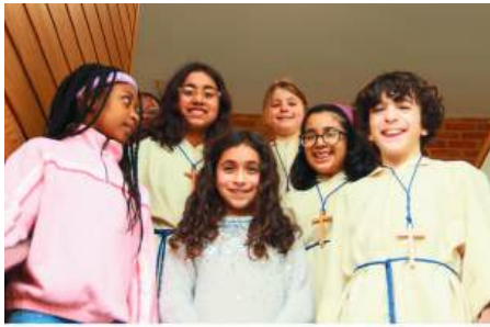
MY LENTEN JOURNEY WITH JESUS - KIDS

Children's Lenten Journey Booklet We have prepared a special booklet: "My Lenten Journey with Jesus – Children's Edition." Please collect one for your children. Those who complete the most tasks will receive a reward! The entire parish community is invited to participate in encouraging and supporting the children in their Lenten journey.